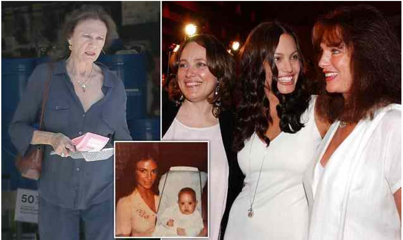
Angelina Jolie's reclusive Hollywood legend godmother breaks cover 49k viewing now